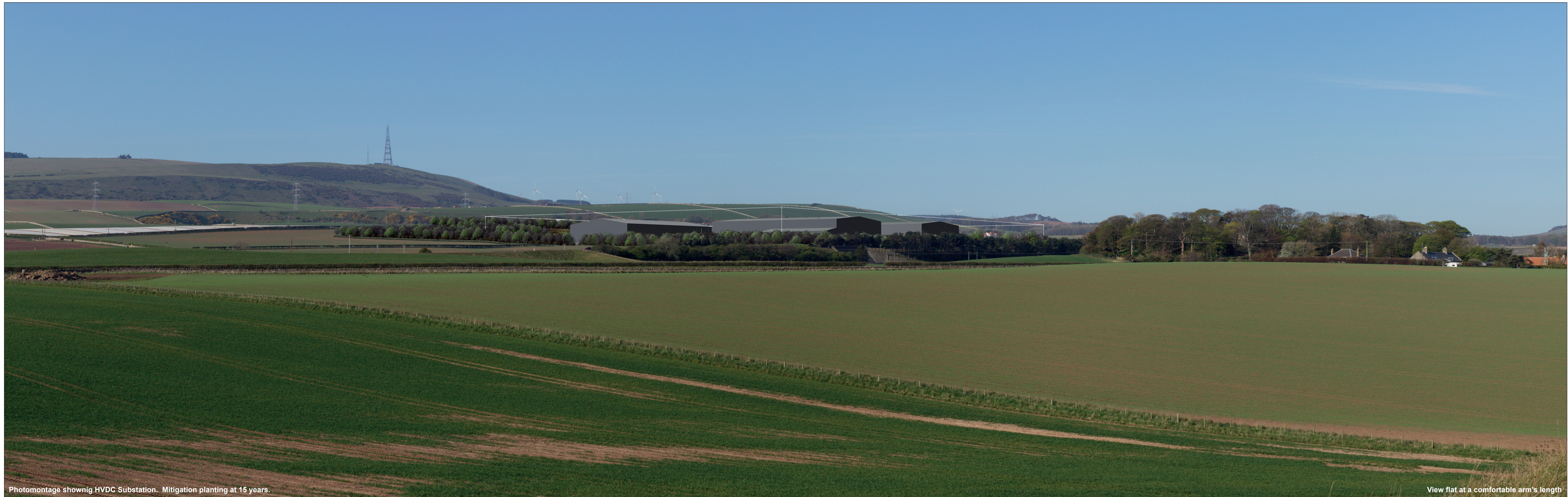
Photomontage showing HVDC Substation. Mitigation planting at 15 years.