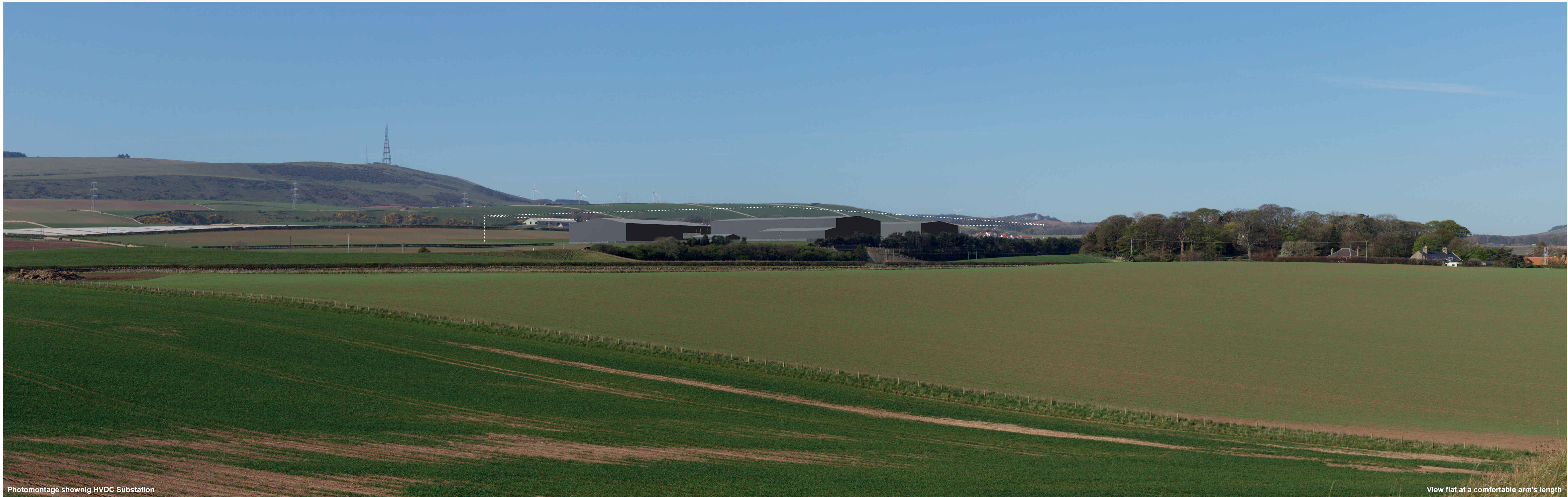
Photomontage showing HVDC Substation