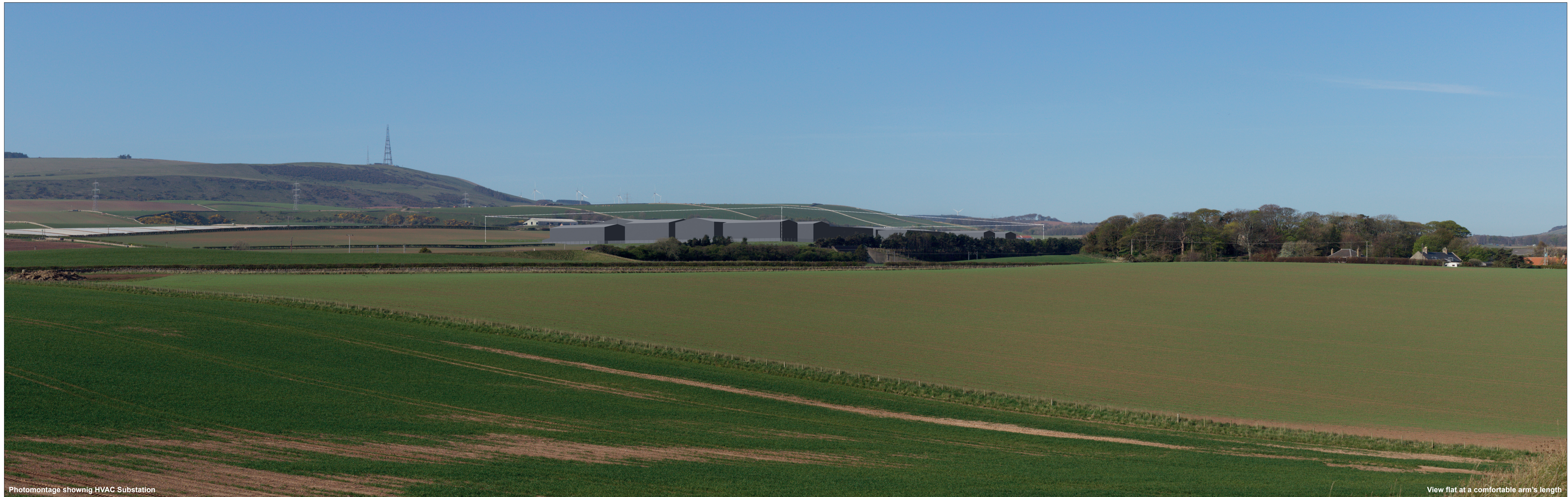
Photomontage showing HVAC Substation