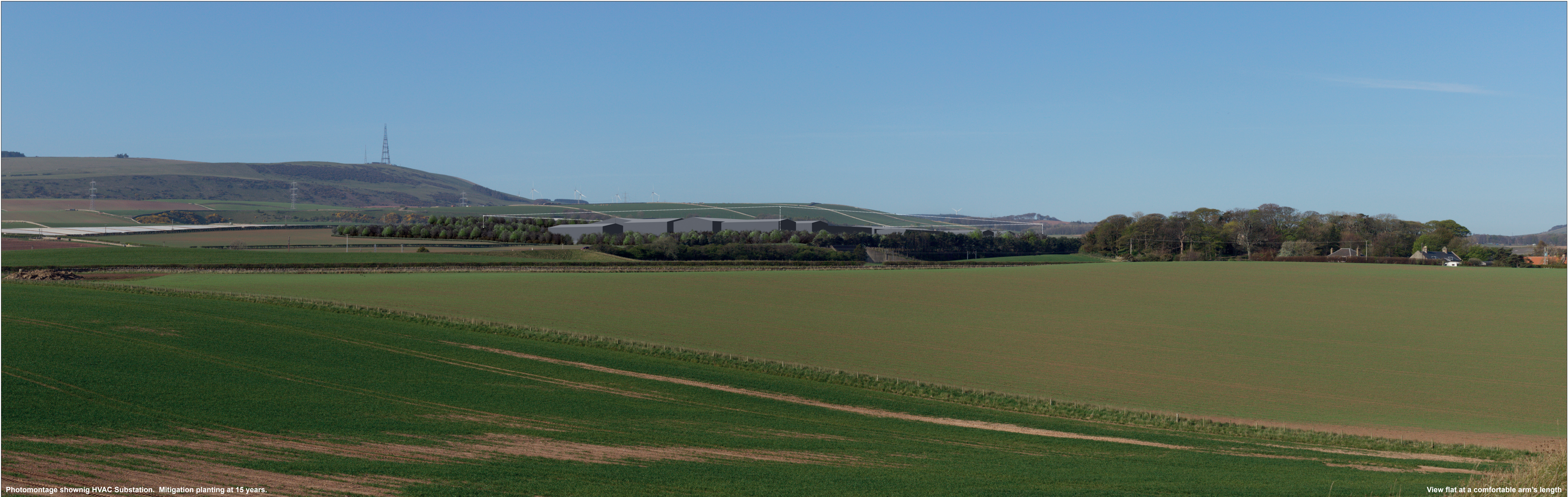
Photomontage showing HVAC Substation. Mitigation planting at 15 years.